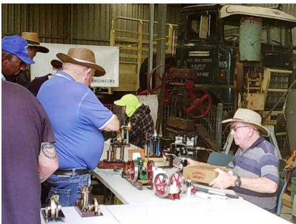
Sparks family miniatures

The Melbourne Model Engineers had, as always a popular display of their miniature steam and I.C. engines in shed 9 along with Plough Books Sales' amazingly diverse range of technical publications .