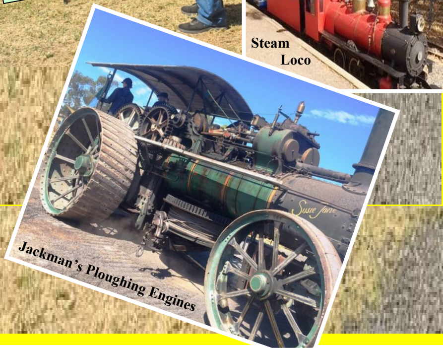
Jackman's Ploughing Engines