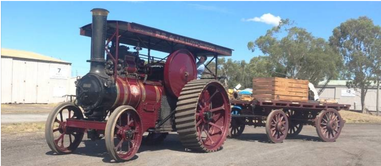
Lloyds Marshall Road Locomotive Blackbutt makes easy work of just one wool wagon