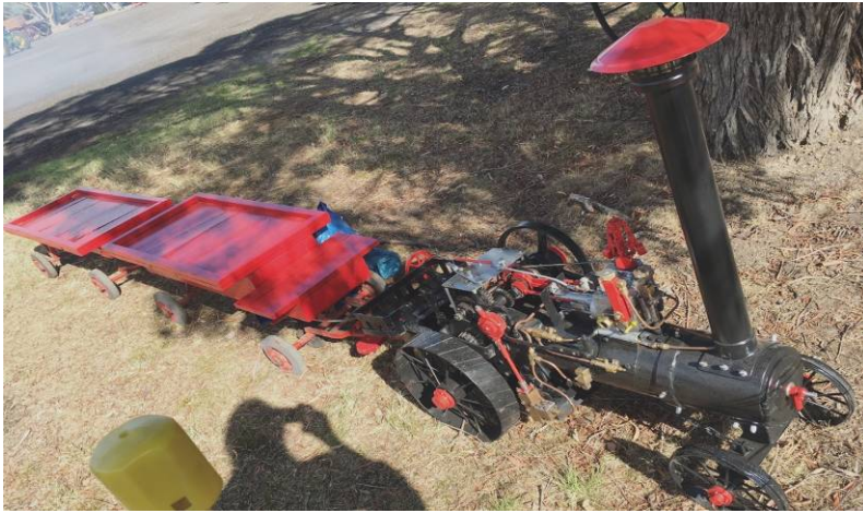
Brad Hector put a lot of work into refurbishing and repainting the clubs freelance miniature traction engine and 2 riding wagons that he is custodian of.

Miniatures Are becoming increasingly popular at UK rallies . Probably because of issues with cost , space, transport difficulties , boiler inspections and now availability of coal . It will be interesting to see if we go the same way . Hopefully we will continue to have both out here.