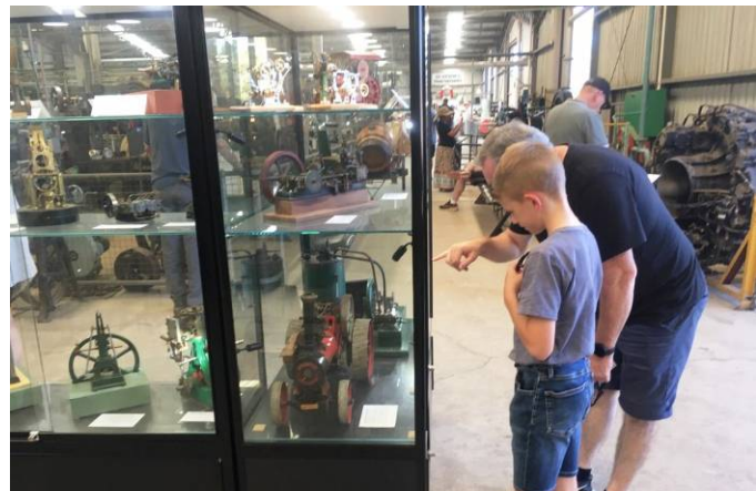
A Dad explains the workings of a miniature traction engine on display with the John Davies collection Warwick pic

The Melbourne Model Engineers had, as always a popular display of their miniature steam and I.C. engines in shed 9 along with Plough Books Sales' amazingly diverse range of technical publications .